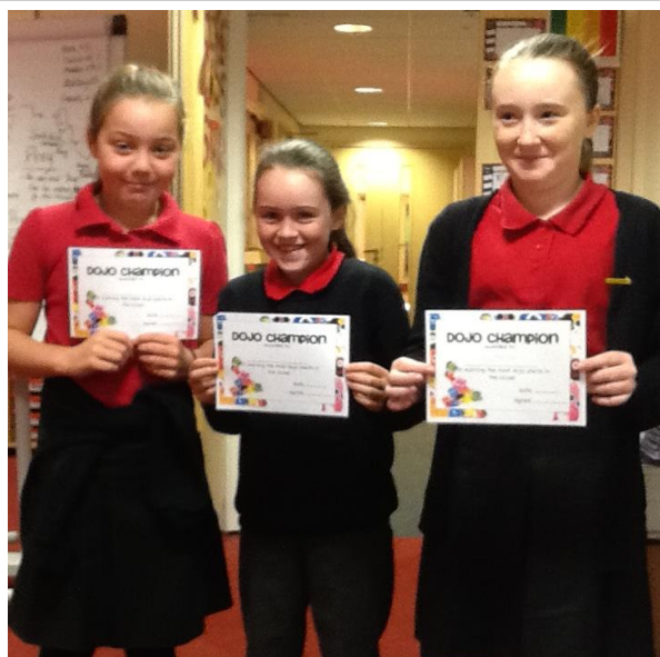
Last week's Year 5 and 6 dojo winners Da Iawn Keep up the good