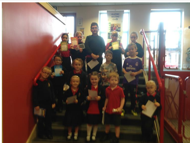
Last week's Stars of the Week